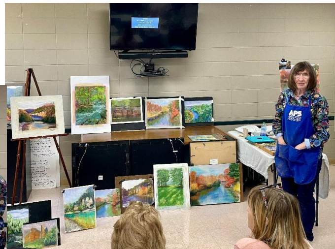
Show and Tell

All agreed that it was a very fun (and fruitful!) workshop.