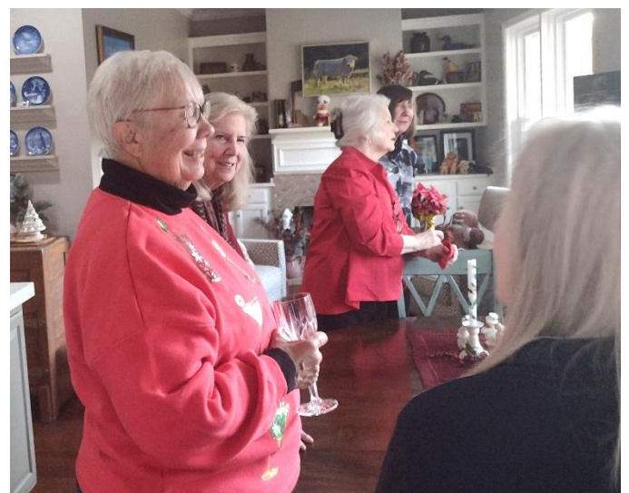
Bird-watching from the window