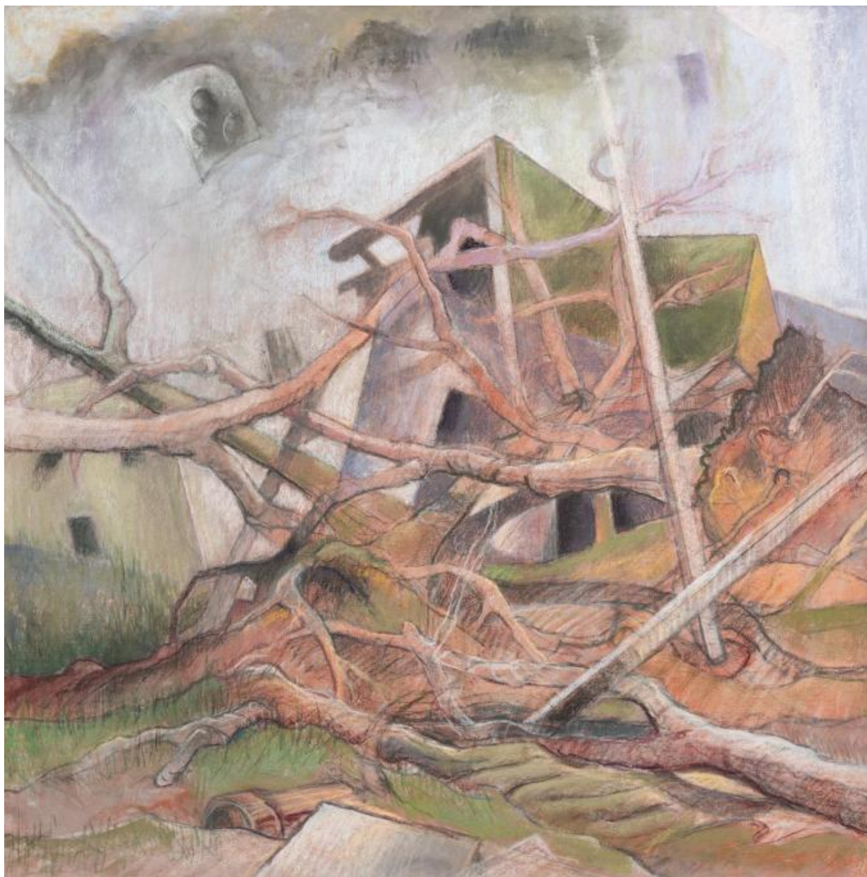
First Place – Dominique Simmons – Broken