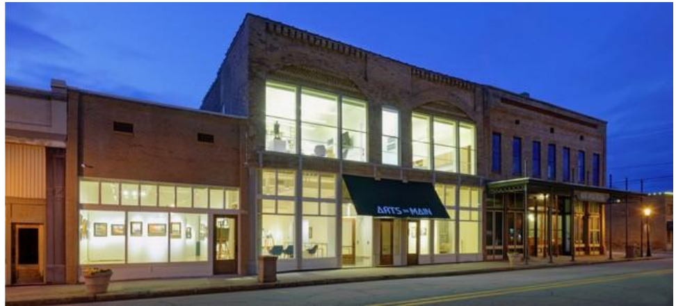
Exhibit will be held at Arts On Main, 415 Main St., Van Buren, AR, 72761, AR, May 8 – June 27, 2026 with an opening reception on

Friday, May 15 th , 6-8 PM. This is a beautiful facility, and we will be exhibiting in two of their three main floor galleries. Shown are photos of the front facade of the main building, the lobby and the two galleries in which our work will be displayed.