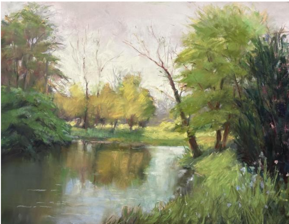
Arkansas Artist' Award --